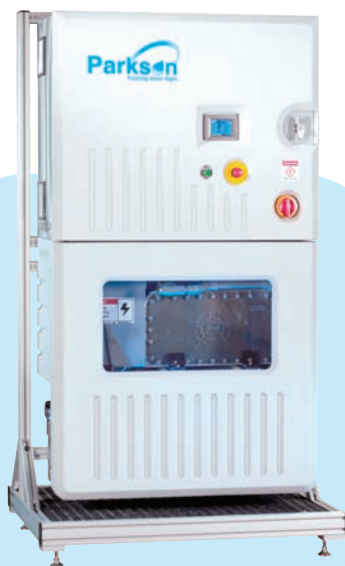
100 lbs./day self-cleaning electrolytic cell

MaximOS™ comes in different capacities with unique features like a self-cleaning electrolytic cell, self-adjusting flow control, remote monitoring, and gives the customer the flexibility to upgrade to the superior mixed oxidant chemistry.