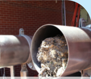
Solids are discharged nicely: cleaned and compacted