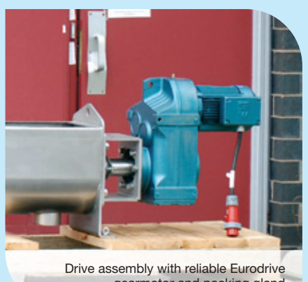
gearmotor and packing gland