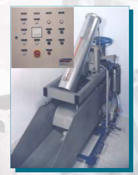
ACU-FLO regulator with servo-control system

The ACU-FLO regulator can be remote-controlled by equipping or retro-fitting with an electric servo-control system. An ACU-FLO equipped with a servo-control unit can be varied from fully open (ON) to fully closed (OFF), either manually on-site or from a remote, central control location. In case of power outages, the regulator will continue to operate automatically maintaining the constant discharge it was last set at.